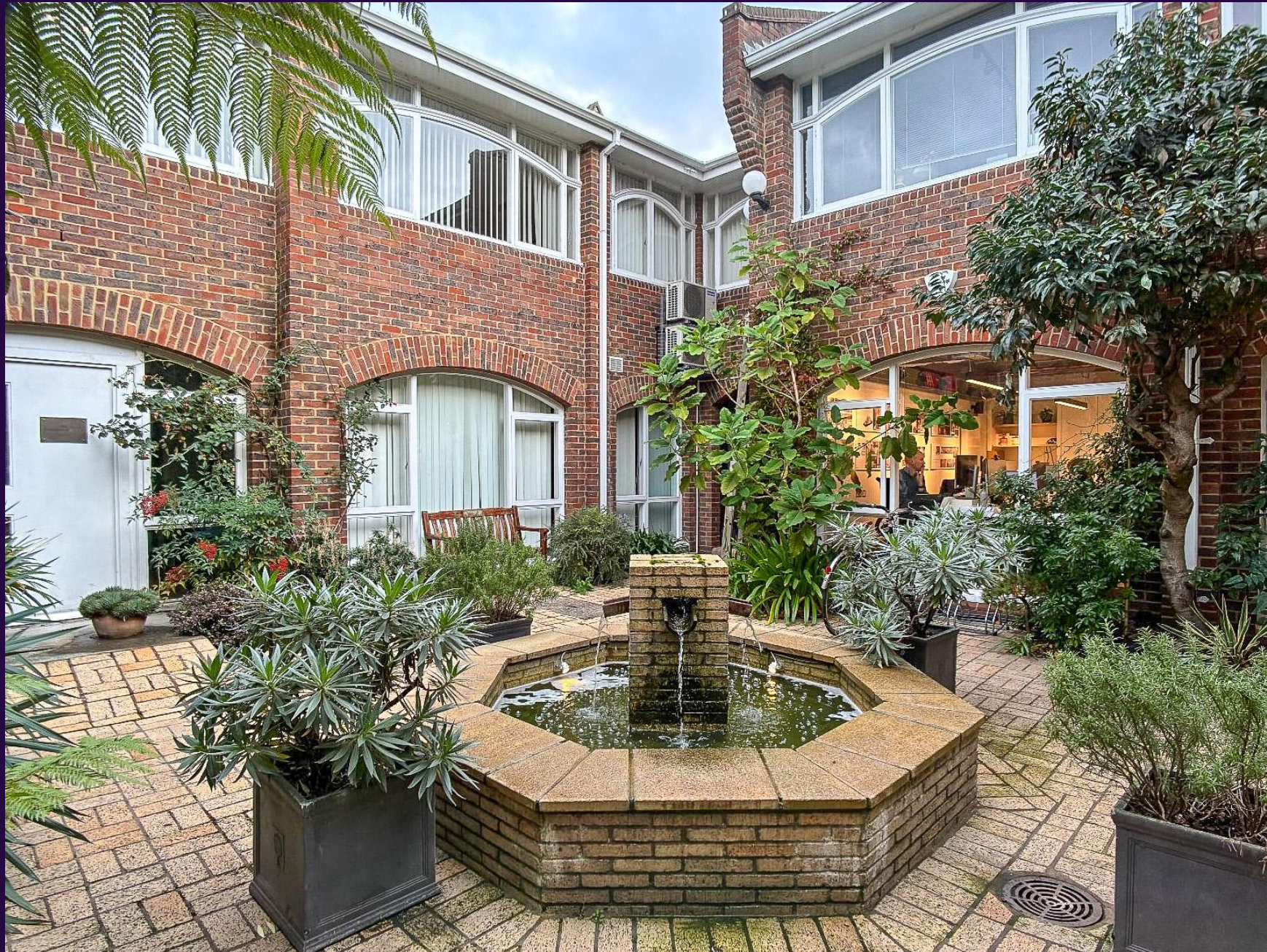
2 Bramber Court, Bramber Road, West Kensington, London W14 9PW