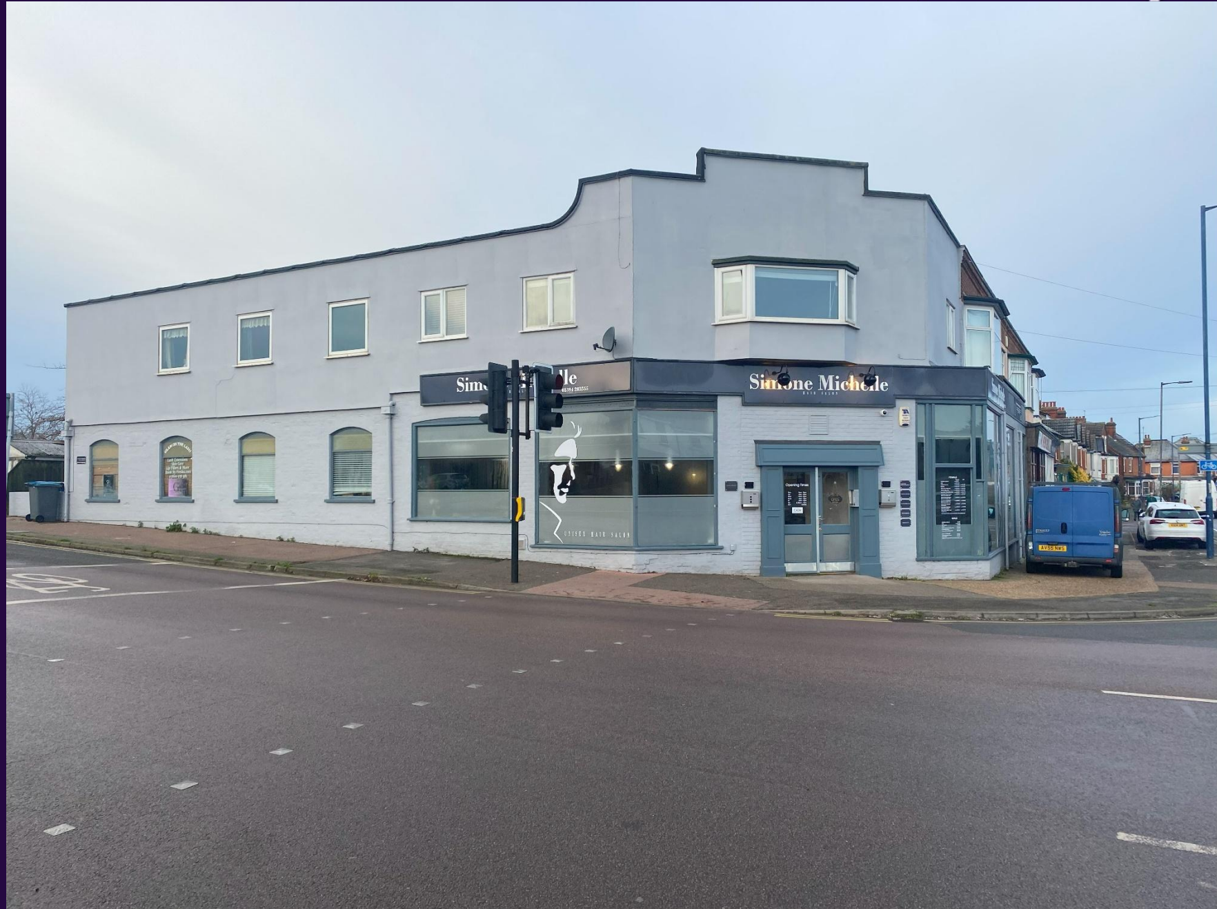
73-75 High Road West, Felixstowe, IP11 9AA